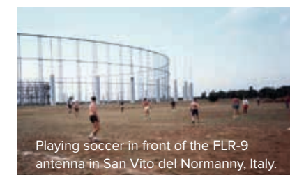
Playing soccer in front of the FLR-9 antenna in San Vito del Normandy, Italy.